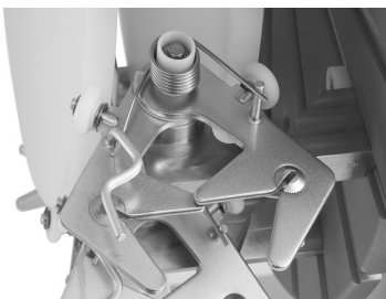
Linking Head Sub-Assembly

The Z-Linker has become the preferred fresh sausage linker in North America because of its high efficiency, versatility, and low maintenance. And, only Nitta Casings brings you 30 years of hands-on experience.